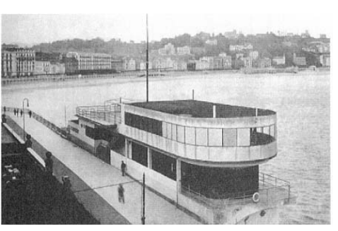
The RCNSS's building circa 1929

rationalism worldwide. December 2000 Basque the Government declared Building Cultural with Interest the category of "Monument".