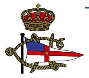
Real Club Náutico San Sebastián